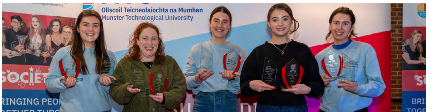
Best New Society: WiSTEM who were also awarded as Best New Society at the BICS National Society Awards