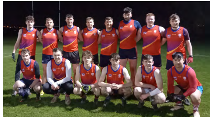
AFL Team-Leeside League

Thanks again, keep safe, happy Christmas and look forward to an action packed 2022!