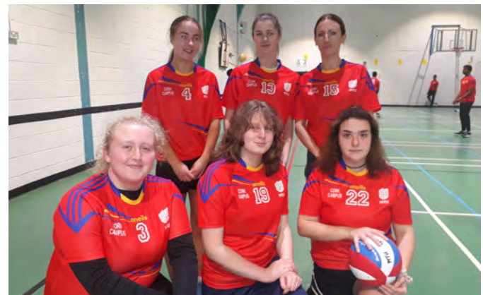
Ladies Volleyball team