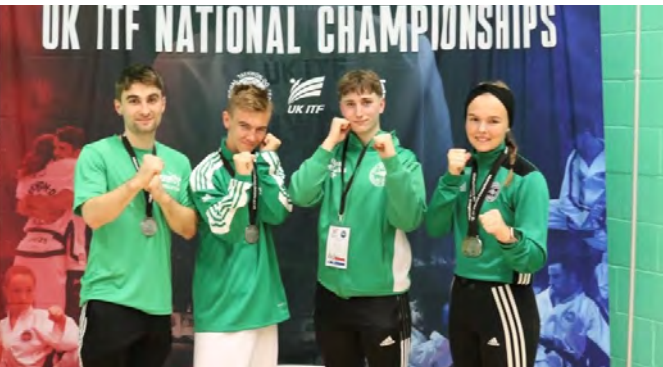
Tae Kwon Do members winning silverware for Ireland