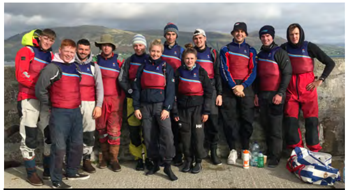
Sailing Club competing at IUSA Northernns