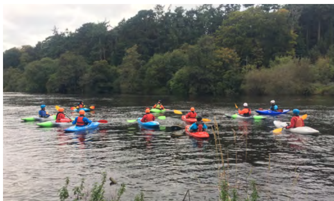
Canoe Club training