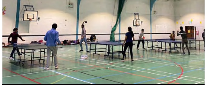
Table Tennis training