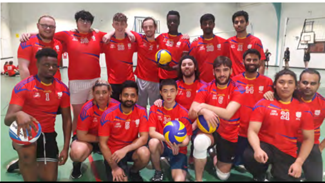
Mens Volleyball team