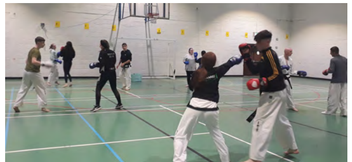
Tae Kwon Do training