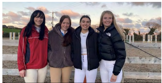
Equestrian Tethrathon team