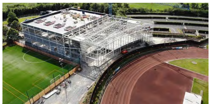
The New Arena taking shape!