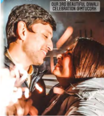
A snapshot of Diwali