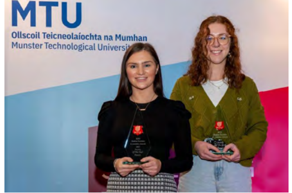
Representatives from Society of the Year: Dance