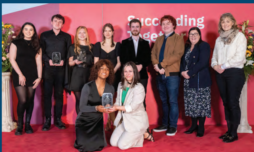
MTU Societies Awards 2025, D&M