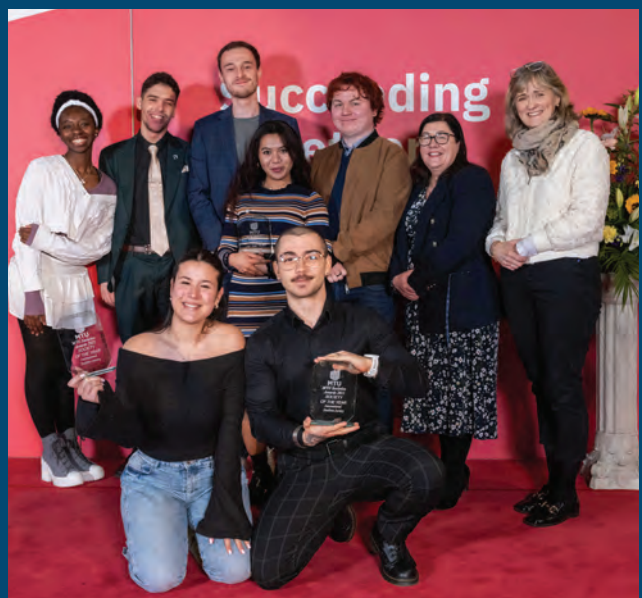
MTU Societies Awards 2025, ISS