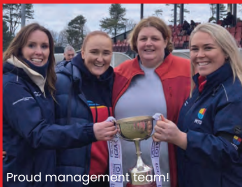
Proud management team!

The MTU Ladies Football Team created history by defeating UCD to win the Higher Education Colleges Lynch Cup on the 15th of March in Queens University Belfast. This is the first time our Ladies Football Club have won this competition, and they did so in some style, qualifying for the O' Connor Cup weekend unbeaten through the group phase.